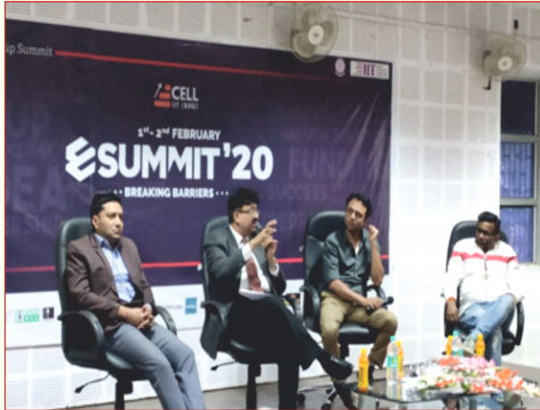
Investors sharing ideas with start-ups on the first day of e-summit-2020